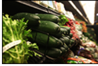
Local produce prices remain constant