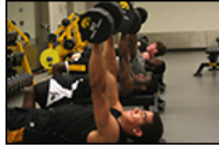
Uthoff ready for debut season