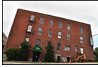
Vine undergoing renovation