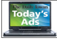
Today's Display Advertising